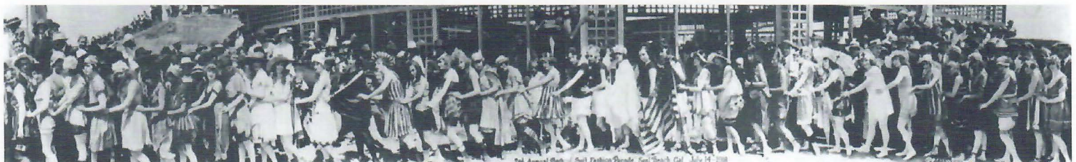
2nd Annual Bathing Suit Fashion Parade, Seal Beach, CA July 14, 1918