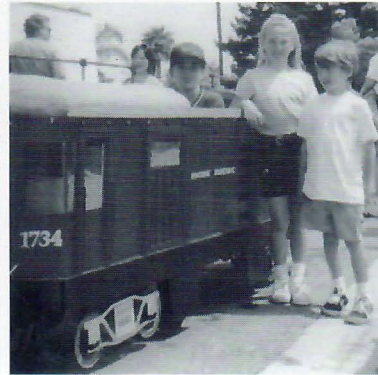
Lil' Red Car