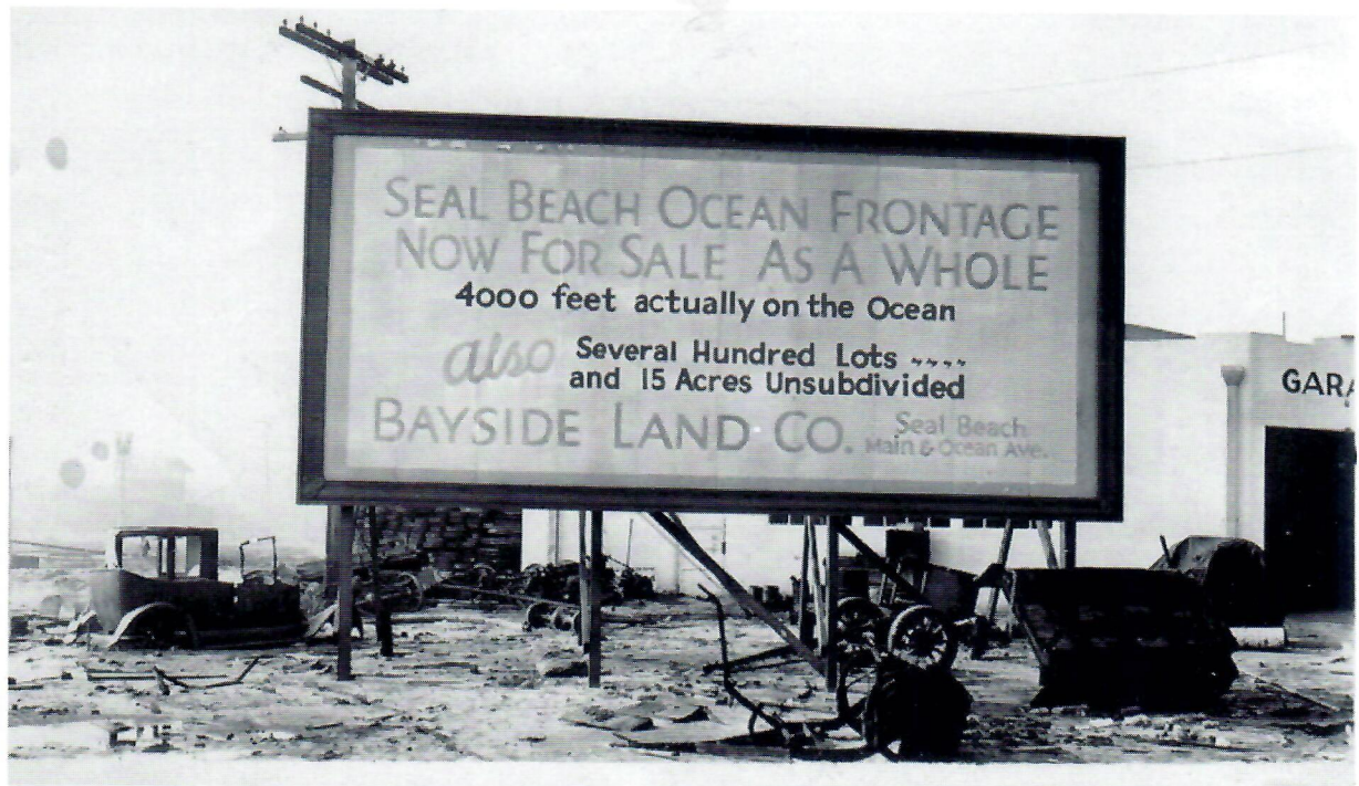
Pacific Coast Highway at 10th Street, Seal Beach - Jan. 1, 1932