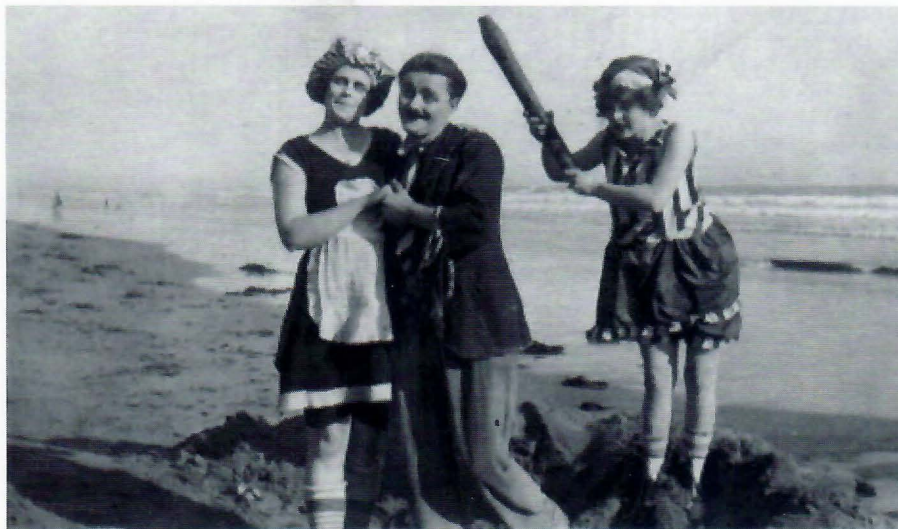
Stars of a 1915 movie filmed in Seal Beach

Say cheese! Start snapping photos of Seal Beach! Our Fifth Annual amateur photo contest is November 30. Titles "Visions of Seal Beach... Through the Lens," photographers are asked to capture their favorite scene of Seal Beach. The winning photo will be displayed in City Hall and all entries will be featured in a special exhibit in the Red Car. Contest winners will receive photography related prizes. For a list of complete rules, an entry form, or more info. call the S.B.H.S. at (562) 683-1874.