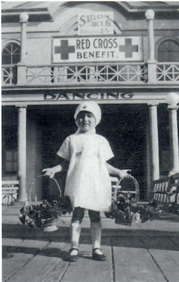
Red Cross Benefit, Seal Beach - Oct 6, 1917